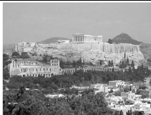
Athens (Acropolis today)