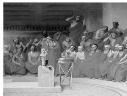
Areopagus -- the official council of Athens that served as guardian of the city's religion, morals and education